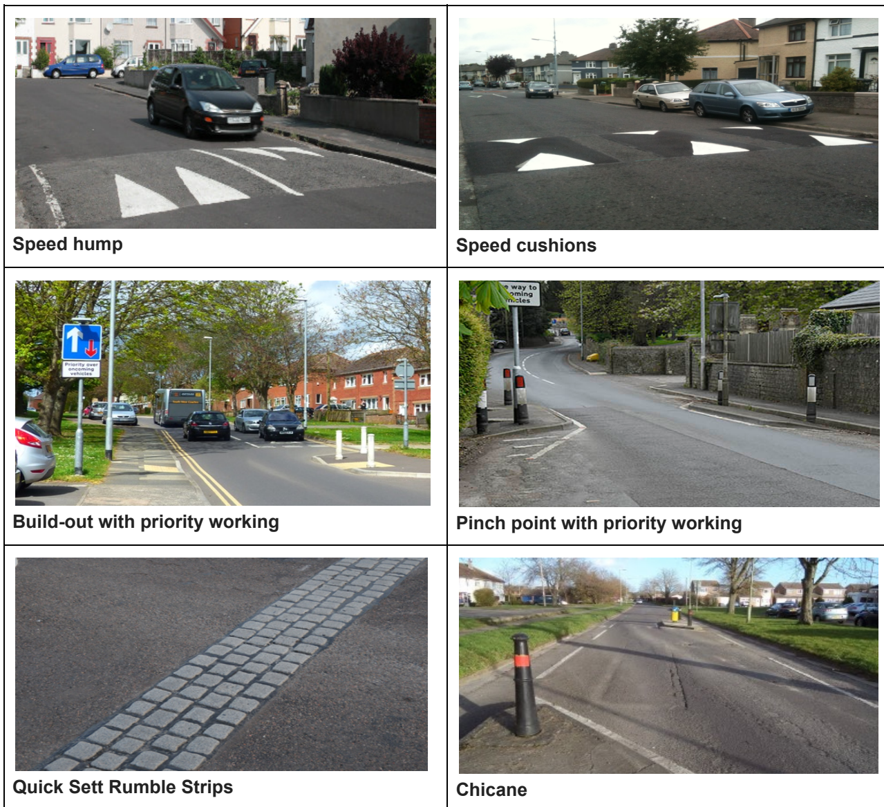
Figure 3. Examples of Traffic Calming Measures

14. Some examples of these different types of traffic calming are shown in Figure 3.