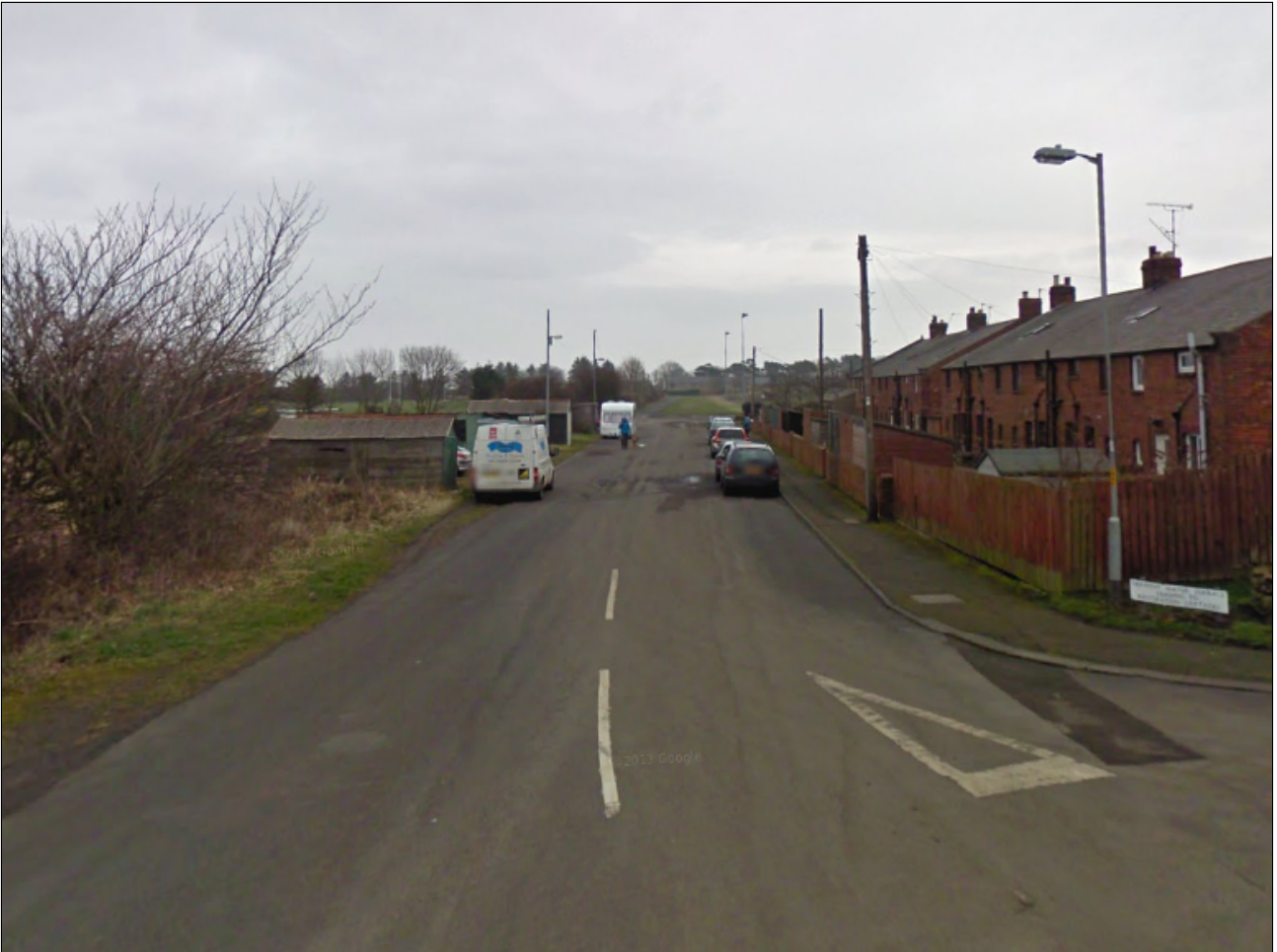
Fig.2. Looking East towards the rugby club.